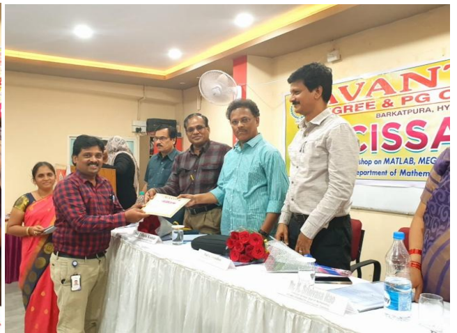
Distribution of Certificates to the participants @ Valedictory Function