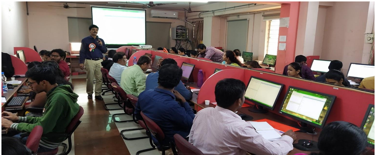
Practice Sessions in the Lab